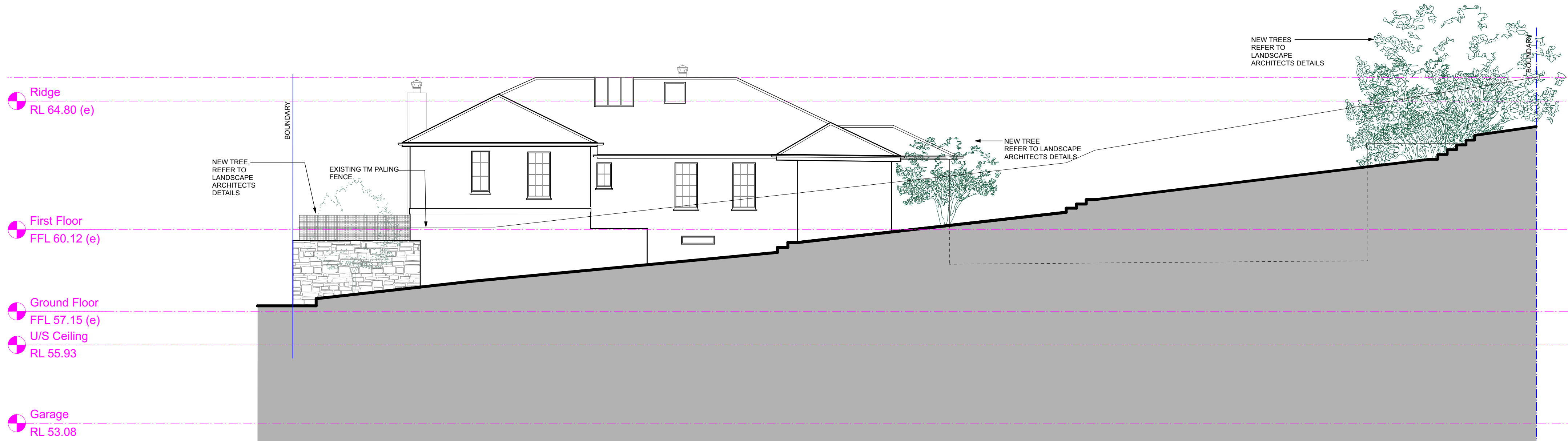
2 South Elevation Scale 1:100